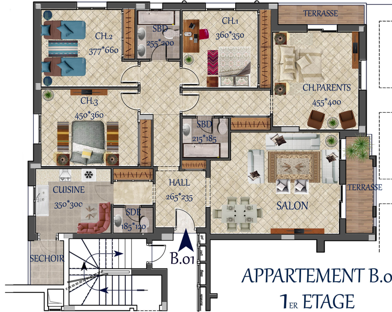
APPARTEMENT B.0.1 1 ER ETAGE